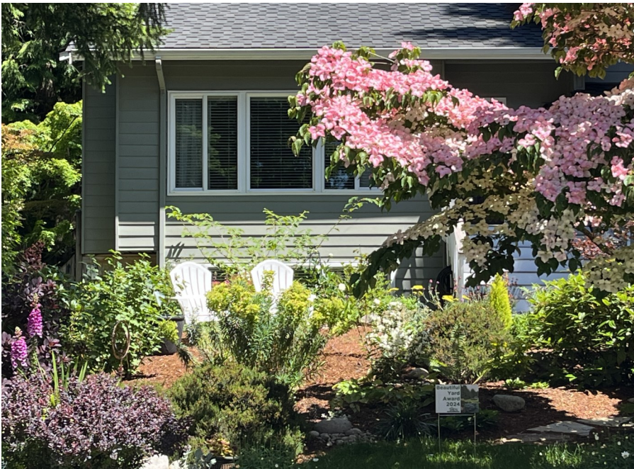
From top: Red Cedar, Huckleberry (1) and (2), Chatham Park