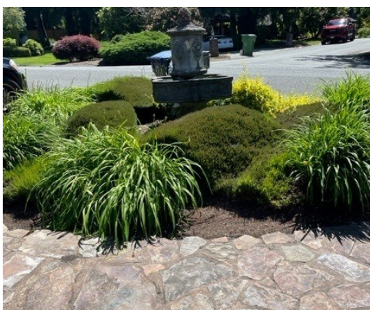
From top l to r: Belvedere Place, Fairway, Cottonwood, Trillium Court, Swordfern