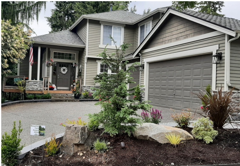
Winners clockwise from top left: Aspen, Woodfern, Wildflower Park and Vine Maple